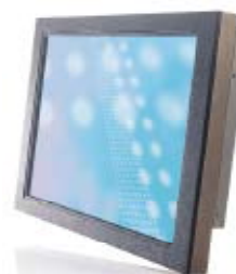
ChassisTouch Monitor with optional flush bezel

(1) Brightness measured on a display with MicroTouch™ ClearTek™ II capacitive sensor. (2) DPMS: Display Power Management Signaling for reduced power consumption during non-use. * Viewing angle measured with contrast ratio ≥10