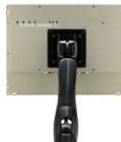
Rear view with VESA-mount arm